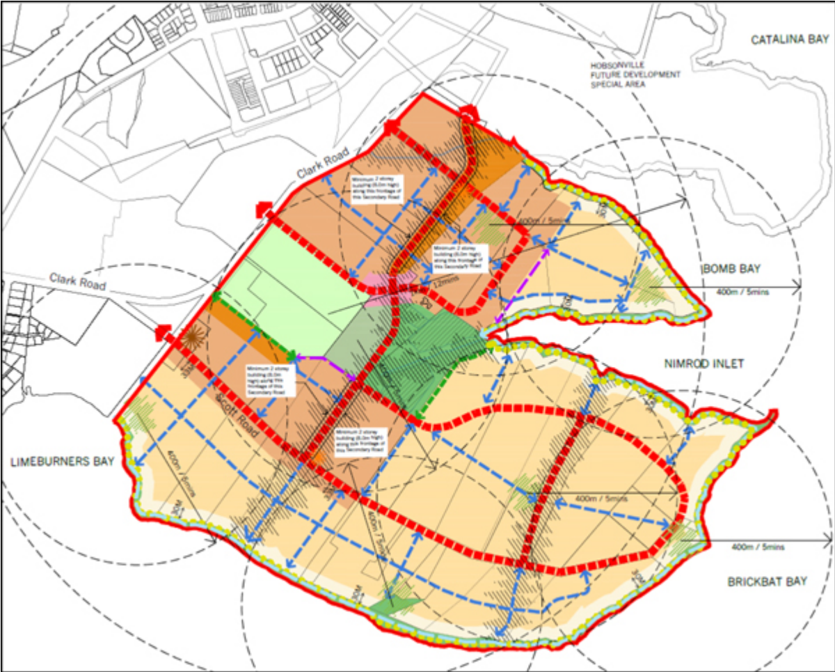
Precinct Plan 2