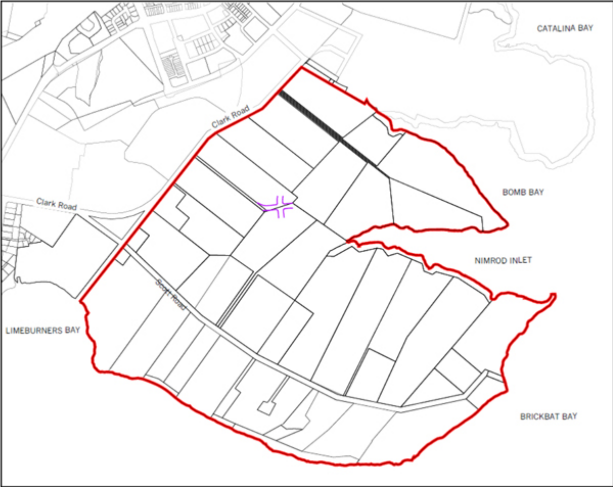
Precinct Plan 1